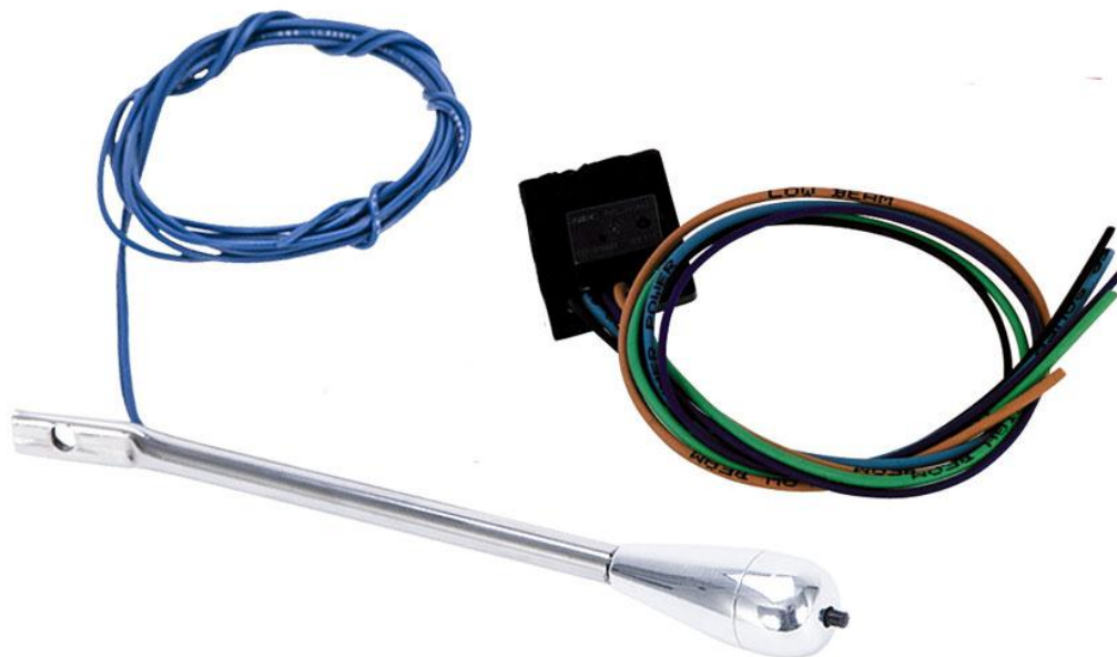
Dimmer Switch, Aluminum Arm (102766)