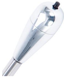
Aluminum Arm with Dimmer Switch (102766)

Momentary pushbutton switch toggles between High/Low Beam headlights.